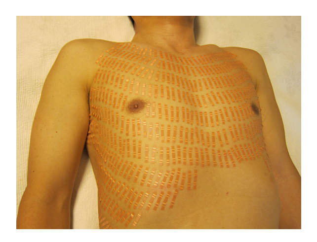
Figure 2 Attachment of type C of chimsband on the chest for depression.

a sensitive or painful response. However, in this case, we attached tapes based on our previous study<sup>8</sup> and practical experiences omitting this typical examination, because we could not obtain exact response from the patient. After attachment, the pulse decreased to 82 bpm. Additionally, when we asked what he felt, he became extremely emotional and started to cry. His grandmother stated that she had never seen him cry since diagnosis of depression. We provided instructions to the guardians on how to attach the medical tape on the