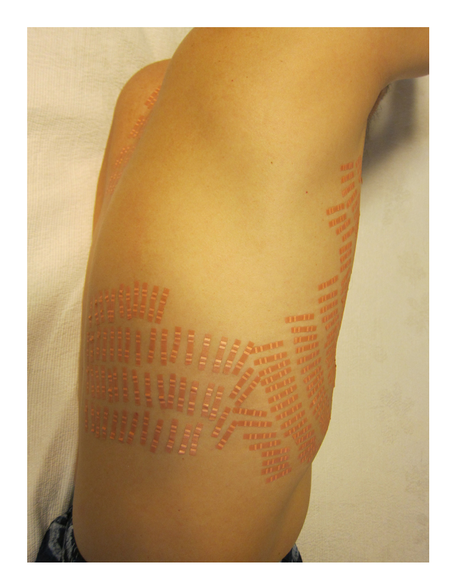
Figure 3 Attachment of type C of chimsband on the sides for depression.

a sensitive or painful response. However, in this case, we attached tapes based on our previous study<sup>8</sup> and practical experiences omitting this typical examination, because we could not obtain exact response from the patient. After attachment, the pulse decreased to 82 bpm. Additionally, when we asked what he felt, he became extremely emotional and started to cry. His grandmother stated that she had never seen him cry since diagnosis of depression. We provided instructions to the guardians on how to attach the medical tape on the